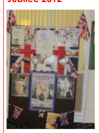
2012 was the Queen's Jubilee year in the UK, and at the Institute we had our own celebrations—shown above!